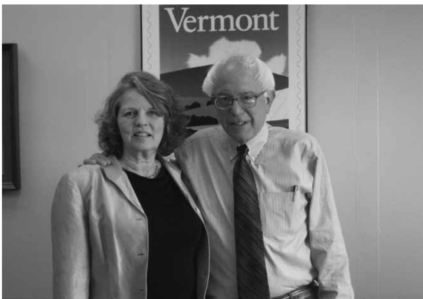
Janet Dermody and U.S. Sen. Bernie Sanders.

VCIL and the Statewide Independent Living Council (SILC) are organizational members of NCIL, but individuals are encouraged to become members as well. If you are interested in becoming an individual member of NCIL, check out the NCIL Web site at www.ncil.org/membership.html , or call toll-free, 1-877-525-3400.