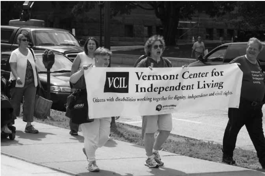
VCIL staff members and peers march to the State-house for the ADA Celebration