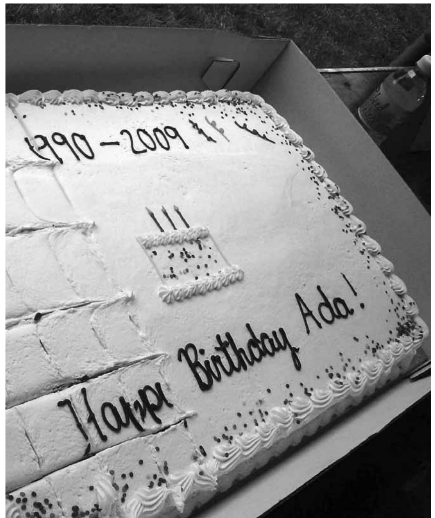
An ADA birthday cake was part of the free lunch at this year's ADA Celebration.